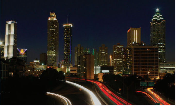
Nighttime lighting confuses migrating birds.

Constructing bird-friendly buildings and retrofitting problematic glass facades can be expensive and time consuming. However, simply turning off or reducing unnecessary nighttime lights is much easier to achieve and can have farreaching benefits. By reducing nighttime lighting, buildings not only save the lives of countless birds, but they can also save money by being more ecofriendly. While there are a myriad of other factors affecting bird-building collisions, we know from other nationwide efforts that "lights out" programs can be an effective way to reduce collision-related bird deaths.