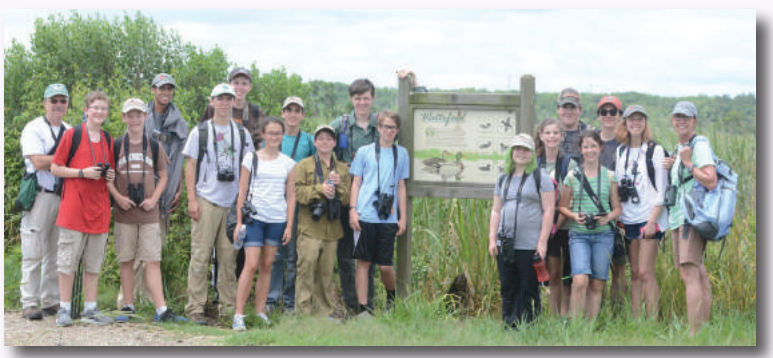
Camp Talon Participants.

For more information and to register, visit: http://www.georgiawildlife.com/CampTALON