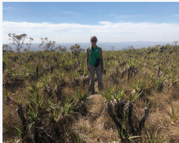
Serra da Canastra, Brazil