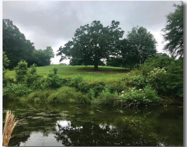
At Candler Park, the Habitat Restoration Fund Grant will be used to remove invasive and exotic plants and install bird-friendly, site-appropriate, native plants.

Located in Tucker, Henderson Park is a 103-acre park that includes soccer fields, a playground, Lake Erin, and walking trails. The improvement project will take place along the Native Plant and Wildlife Walk, a paved path meandering through a corner of the park. The project goal is to restore a