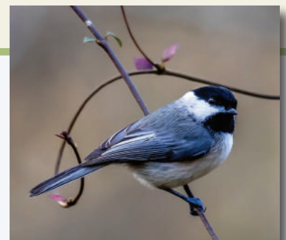
This shot of a Carolina Chickadee is the winner of the April Photo of the Month Competition.