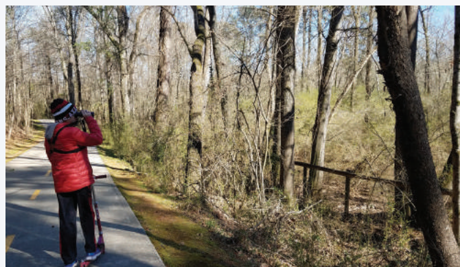
Atlanta Audubon recently received grants from GOS and Patagonia to restore bird-friendly habitat at Big Creek Greenway in Alpharetta.

Atlanta Audubon was recently awarded a grant from the Georgia Ornithological Society's (GOS) Bill Terrell Avian Conservation Grants fund to implement bird-friendly habitat restoration at Big Creek Greenway in Alpharetta. Grant funding from GOS will combine with funding from Patagonia Atlanta to allow Atlanta Audubon to restore ten acres of important habitat along a stretch of the Greenway. The focus of this restoration project will be to create bird-friendly habitat by removing invasive and exotic plant species such as Chinese privet and oriental bittersweet, and installing native plants that will assist resident and migratory birds to use the area as nesting, foraging, and stopover habitat.