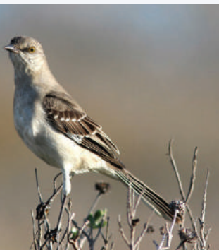
Northern Mockingbirds are known for their assertive personalities.

Q: Greetings, Chippy. We have had a pair of aggressive mockingbirds guarding our feeders for the past six months or so, and I need some advice on how to deal with them.