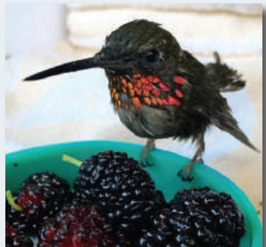
Shep was Atlanta Audubon's first Ambassador Bird.