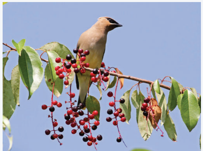
Cedar Waxwing in black cherry (Prunus serotina).