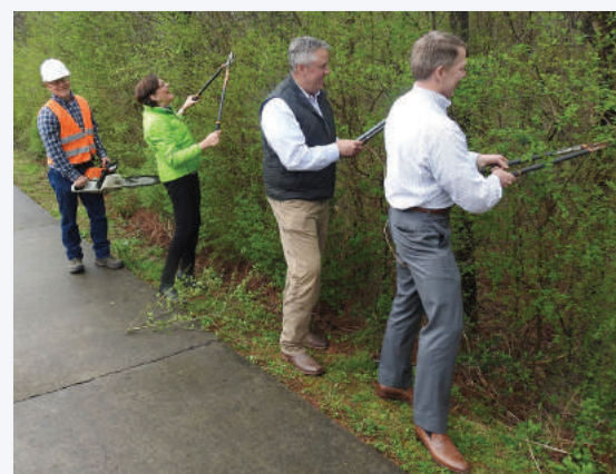
Before: A ceremonial privet cutting to open Phase I of the habitat restoration project in 2019.

Atlanta Audubon was recently awarded a grant in the amount of $20,900 from the Georgia Ornithological Society's (GOS) Bill Terrell Avian Conservation Grant fund to implement a second phase of bird-friendly habitat restoration at Big Creek Greenway in Alpharetta. Atlanta Audubon will restore ten additional acres of bird-friendly habitat, building on the 12 acres restored during phase one of this project in 2019. Atlanta Audubon will partner with the City of Alpharetta, Georgia Native Plant Society, and the Ed Isakson/Alpharetta Family YMCA to complete this work.