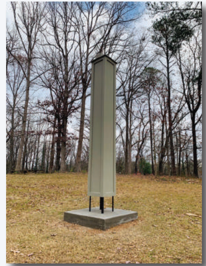
Atlanta Audubon will be constructing a 12-foot Chimney Swift Tower at Freedom Park that will be similar to this one at Henderson Park.

Freedom Park is a free public park that was born out of formidable citizen activism linking the movements of environmentalism, urbanism, historic preservation and more. As one of Atlanta's largest public green spaces, Freedom Park spans more than 200 acres, linking diverse areas such as the Martin Luther King, Jr., National Historic Site, Old Fourth Ward, Inman Park, Poncey-Highland, the Carter Center and the Jimmy Carter Presidential Library, Candler Park, Druid Hills, Virginia Highland, and Little Five Points.