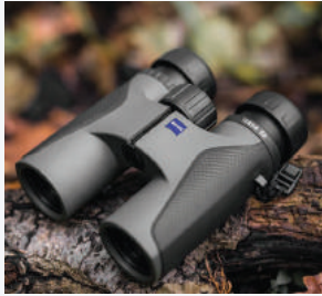
Zeiss TERRA ED 8x42 binoculars.

Try your luck at one of two great prizes we have lined up for this year's Atlanta Bird Fest raffle: one set of Zeiss TERRA ED 8x42 binoculars and the framed, original Atlanta Bird Fest 2020 artwork featuring a Barred Owl. Raffle tickets may be purchased for $5 each or $20 for 5 tickets. The drawing will take place at our Atlanta Bird Fest Closing Celebration on Sunday, May 17, at SweetWater Brewery.