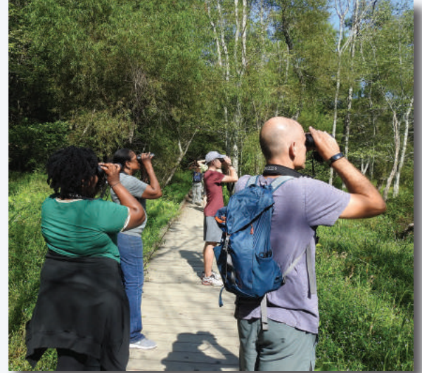
Studies show that spending time connecting to nature, especially with birds, is beneficial to our physical and mental health.

Have a great spring, and I hope you can join us at a special place for birds and people: Atlanta Bird Fest. See you there!