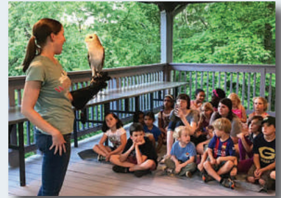
The Owl Prowl is a great activity for the whole family.

Join Atlanta Audubon and the National Park Service for a family-friendly evening celebration around the campfire with s'mores and live owl programs by AWARE Wildlife Center, ending with an easy guided night hike by Jerry Hightower. Discover new facts about the wildlife of the Chattahoochee River National Recreation Area and their nocturnal habits. Dress for the weather and wear comfortable outdoor clothes and shoes suitable for walking on a forest trail. Don't forget your flashlight! Learn more or register at www.atlantaudubon.org/abf-events