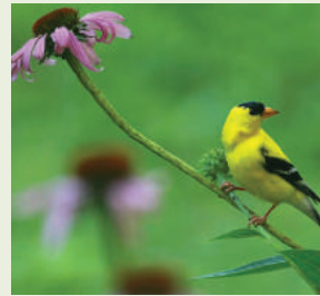
American Goldfinch on purple coneflower, by Dan Vickers.

In a similar light, my interest in birds began to grow and I started looking up instead of staring at the ground all of the time, catapulting my ecological understanding to a new level. As I learned to identify different species, not only by sight but also by ear, I immediately started to see patterns. Certain species were more active at different times of day, in different weather conditions, and in different habitats. The bird calls I would hear outside my window each morning suddenly told me a different and more detailed story about what was happening around me.