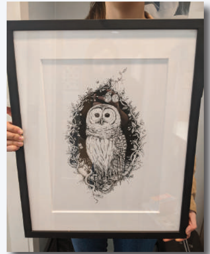
Atlanta Bird Fest 2020 framed original artwork.

For more information and to purchase raffle tickets, visit www.atlantaaudubon.org/raffle .