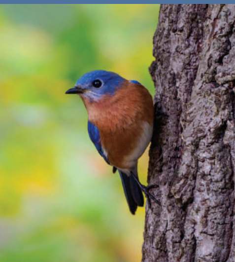
Eastern Bluebird