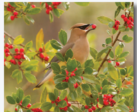
Cedar Waxwings are known to gorge on berries.