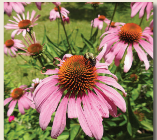
Bee on a purple coneflower (Echinacea purpurea), by Dottie Head.

Native plants not only provide the highest-quality resources for wildlife but have many benefits to people as well. Homeowners can save water by reducing lawn size, and the added plants can even help control flooding. Native plants are hardy and well-adapted, so they thrive without synthetic fertilizers and pesticides, which hurt our pollinators, reduce prey availability, and can run off into streams. Finally, native plants and the wildlife they sustain provide color and beauty, right in your own backyard. We hope to see you at a plant sale this spring.