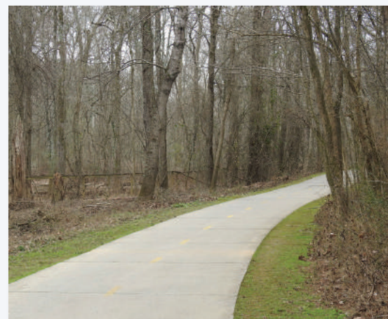
After: A section of the habitat restoration area after invasive plants have been removed and replaced with native species.

Big Creek Greenway is a linear park that runs approximately eight miles from its northernmost point near Windward Parkway in Alpharetta to its southernmost point near Mansell Road in Roswell. This park has proved to be a very important greenspace for resident and migratory birds in Fulton County, with more than 190 bird observations recorded on eBird. Birds that will benefit from the habitat restoration work include several species that are listed on Georgia's State Wildlife Action Plan (SWAP), including the Brown-headed Nuthatch, Common Grackle, Chimney Swift, Brown Thrasher, Wood Thrush, and Rusty Blackbird. SWAP is a statewide strategy to conserve populations of native wildlife species and the natural habitats they need before these animals, plants, and places become rarer and more costly or difficult to conserve.