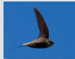
The Chimney Swift is the 2019-2020 Focal Species for Atlanta Audubon.

Ultimately, the Chimney Swift is a bird connected to people. With their epic agility and stamina, their taste for biting insects, and their propensity for nesting in our chimneys during the summer months, Chimney Swifts and humans have a unique connection. We need to pitch in to ensure the continued health of this species.