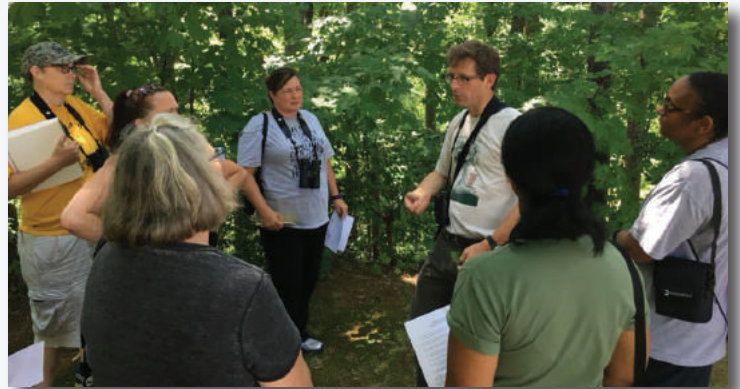
The Taking Wing teacher education program trains teachers how to teach students about birds and native plants.

The program was launched in 2012, and more than 140 educators have been trained through it, with an estimated engagement of 4,500 youth to