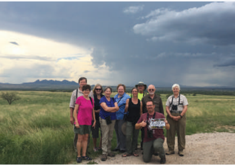
Monsoon Madness 2018