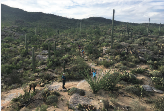
Exploring Saguaro National Park, by Melanie Furr.