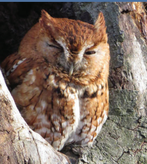
Eastern Screech Owl