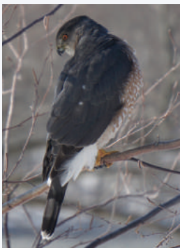
Cooper's Hawk

Cooper's Hawks are accipiters, with broad, rounded wings and a long tail. Their head often appears large. You may recognize them in the air by their flap-flap-glide pattern of flying. I've attached a photo from National Audubon Society. Does this look like your bird?