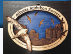
These new Atlanta Audubon Chimney Swift ornaments will be for sale at the Holiday Party. Ornaments designed by Tim Weberding Woodworking.

Please join us on Sunday, December 9, from 3:00 to 5:30 PM for the annual Atlanta Audubon Holiday Party and Silent Auction at Manuel's Tavern. We'll be in the main dining room rather than our usual back room for this event. We're going to mix things up a bit this year and scale back the number of auction items. We'll be offering fewer, higher-quality items for bidding, plus enhanced merchandise in the Atlanta Audubon store, including our exclusive shade-grown, organic coffee blend, Xocolatl chocolate bars, bird earrings, T-shirts, hats, notecards, books, and more. All proceeds benefit the conservation and education efforts of Atlanta Audubon. This gathering will also serve as our annual meeting. We'll hold a brief business meeting to introduce and elect board members for 2019. Atlanta Audubon will provide a variety of appetizers, and, of course, additional food and beverages will be available for purchase