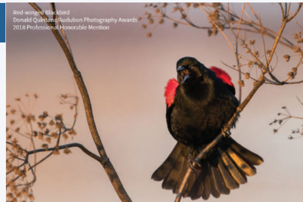
Red-winged Blackbird Join us for an exhibition of the Audubon Photography Award Winners at Brickworks Gallery on February 9, 2019.