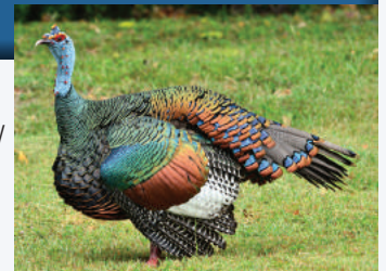
The Ocellated Turkey is one of the many bird species the group hopes to see.