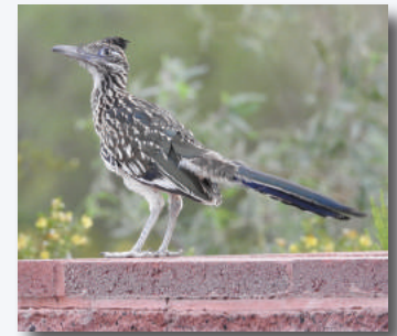
Greater Roadrunner, by Melanie Furr.

Rufous-winged Sparrow. Before long, everyone was out in the parking lot with binoculars. Approaching monsoon clouds providing a cooling breeze as we watched fledgling roadrunners chase their parents around the hotel grounds.