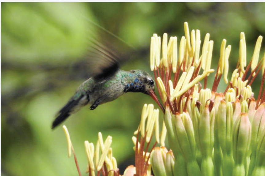
Broad-billed Hummingbird feeding on agave flowers

More information, complete itineraries, and registration for both trips can be found at www.atlantaudubon.org/travel .