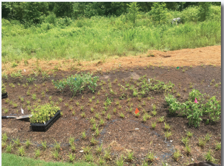
Plant installation has begun in the Exhibitat at Piedmont Park.