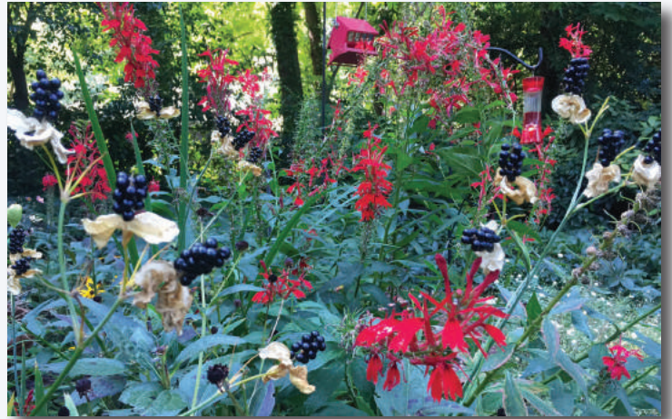
The 2018 Wildlife Sanctuary Tour will feature homes in the Decatur area.

On Tuesday, September 25, Atlanta Audubon will unveil the "Exhibitat" and celebrate the completion of Atlanta Audubon's native plant garden and Georgia's first Chimney Swift tower in the Piedmont Commons. During the day, participants in our Chalk Art Festival will complete 5' x 5' chalk art paintings in front of the "Exhibitat" in celebration of Georgia's native plants and animals. In the evening, we will officially unveil the project while enjoying food and drink.