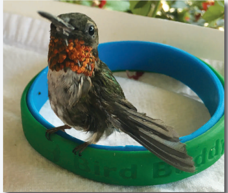
Shep on his favorite perch.

more time perching than a wild bird would, so he has perches of different widths and textures in his enclosure (an 18"x18"x12" terrarium) to minimize foot problems; his favorite perch is a silicone bracelet that says "Bird Buddy." Since