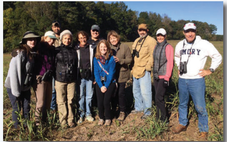
Master Birder Class of 2016.