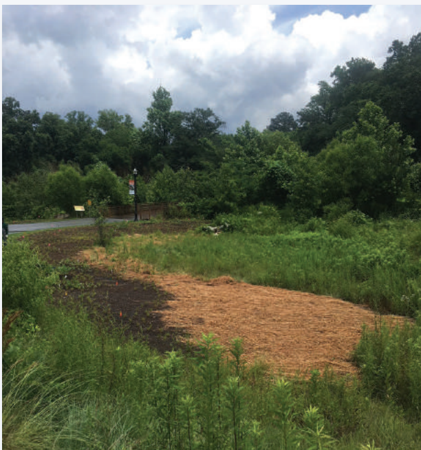
The Exhibitat at Piedmont Park will feature a native plant demonstration garden and a Chimney Swift Tower.

Look for more information on all of these events in future issues of Wingbars and Bird Buzz .