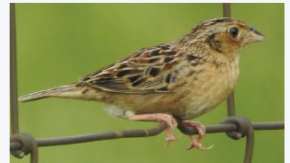
The Grasshopper Sparrow is named for its buzzy, insect-like song.