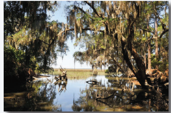
Forest and Marsh at Cumberland Island.

There are threats, though. There is a new coastal threat to birds and wildlife that we are focusing on: the proposed spaceport in Camden County, Georgia's