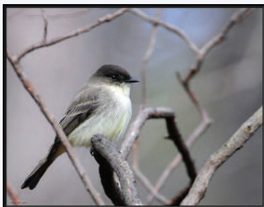
Eastern Phoebes often build nests in garages and under porches.

Q: The last couple of years, we've had Eastern Phoebes nesting just inside our garage door. In April, they had laid eggs. The nest is now empty. I assume they fledged, although we never saw them (we saw the fledglings last year). I thought that was it for this year, but the pair has returned and is carrying material to the nest, presumably getting ready for another brood. Is it unusual for Eastern Phoebes to lay another brood so soon?