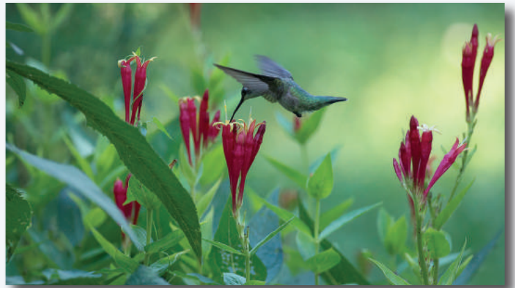
Ruby-throated Hummingbird on Indian Pink

Registration and ticket sales will begin in mid-July. More information on these events will be available later this summer in Wingbars and Bird Buzz , and on our digital platforms.