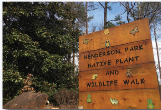
Henderson Park in Tucker will be the site of a new Chimney Swift tower thanks to a grant from the Georgia Ornithological Society.