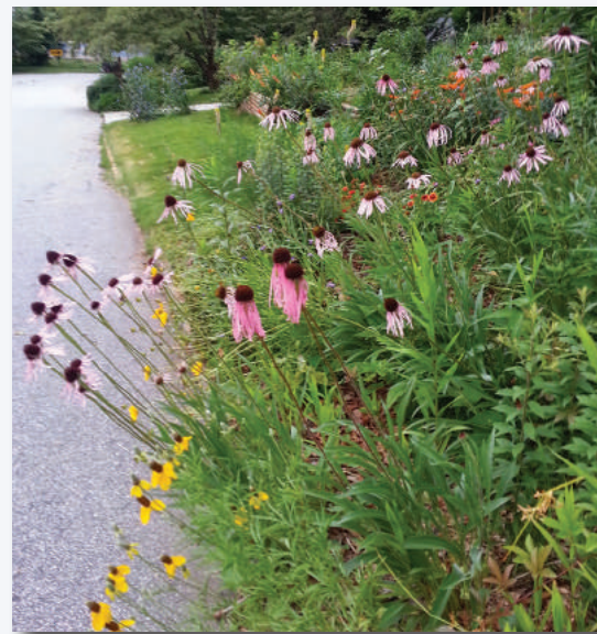
Is your yard ready to be certified as an Atlanta Audubon Wildlife Sanctuary?

As conservation biologist and National Geographic fellow Thomas E. Lovejoy has observed, "If you take care of the birds, you take care of most of the big environmental problems of the world." Please join me in this work. We can do this!