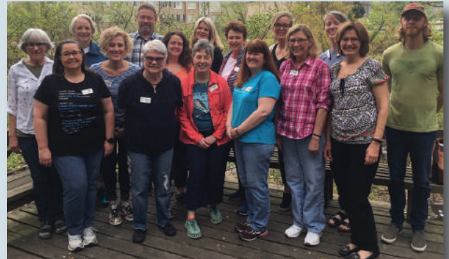
Registration for the Fall 2019 Master Birder Class will open in July.