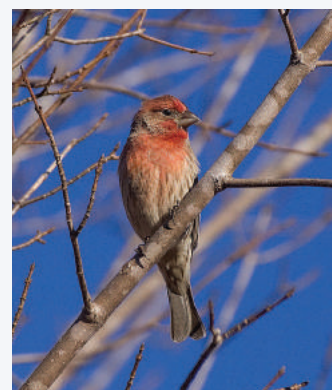
House Finches are particularly susceptible to eye diseases.