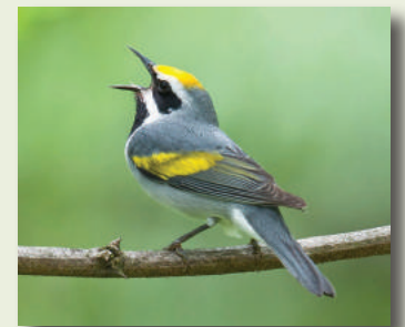
Golden-winged Warbler.