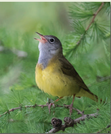
Connecticut Warbler