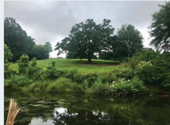
Candler Park received a Habitat Restoration Grant in 2019 to restore a bird-friendly wetland habitat along the riparian corridor in the north-central portion of the park.

The application deadline for the 2020 award period is September 2, 2019. One project for 2020 will be chosen by committee and announced at the end of October. To learn more about eligibility, criteria, and schedule for this new opportunity, please go to www.atlantaaudubon.org/habitat-restoration-fund .