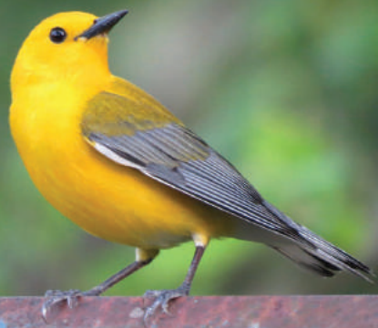
Prothonotary Warbler