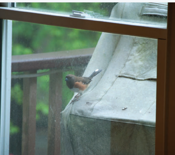
The perpetrator poised for the next attack.

Q: I have a female towhee that comes to my house every day and continually jumps at our window. I am concerned that she might hurt herself. There are no plants in the window or anything I can think of that might attract her. Any suggestions?