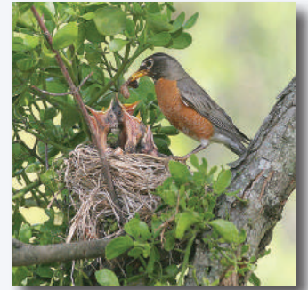
American Robins in a nest