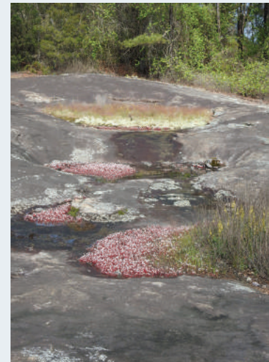
Workshop participants will learn about the different geologic regions of Georgia, including the "monadnock madness" of Stone, Arabia, and Panola mountains.

Price: $40 for members, $45 for non-members