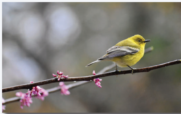
Pine Warbler