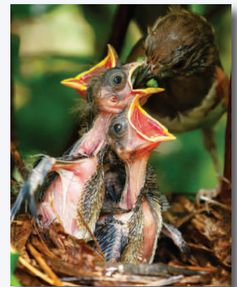
A nest full of Eastern Towhees

So while the last Cape May and Canada Warblers are making their way north, I encourage you all to not just dream of the fall to come but rather devote yourself to learning more about those nesting chickadees and towhees. Try to find a nest or some newly-fledged babies. This isn't easy but it is a worthy challenge, and you will learn much along the way. When the House Wrens stake claim to your nest box, give them some study and report your findings. Monitor them safely and consciously. Be active with community science, visit parts of the city or state that maybe you haven't in the past, and enjoy the excitement and energy that flows from this summer season.