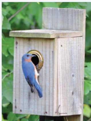
Male Eastern Bluebird on a Nestbox.