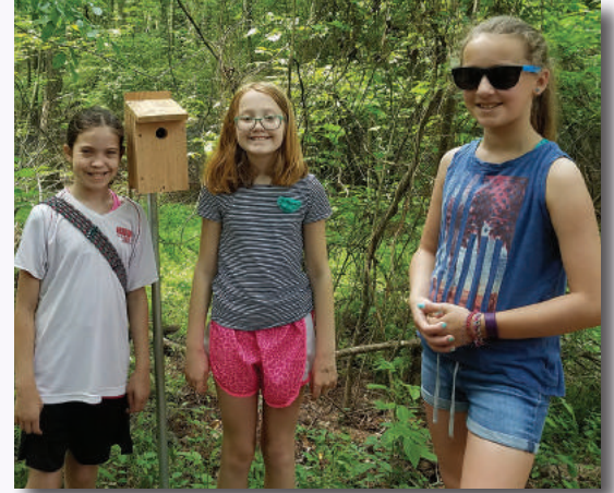
Girl Scouts from Alpharetta-based Troop #12495 built and installed Brown-headed Nuthatch boxes to create habitat for this declining species.

Atlanta Audubon has gone through a transformation over the past couple of years. While we may look a little different and feel a little different, we continue to support and value these seemingly small community projects. It's a part of who we are as an organization. The Board of Directors and staff took a close look at who Atlanta Audubon is in 2017, and as a result, we have crafted our next strategic plan. During that process, we felt our