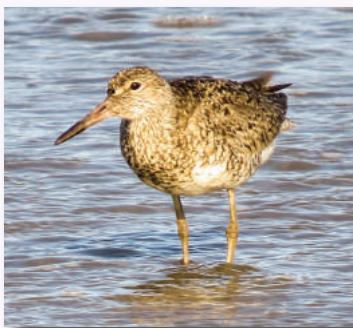
Eastern Willet, by Adam Betuel

This year's proposals have been submitted and will likely affect the birds we see here in Georgia. One of the most high-profile proposals is the possible splitting of the Eastern and Western Willet. If you frequent the Georgia coast, you have likely seen a Willet. Depending on when you visited and if you were paying close attention, you may have seen both the Eastern Willet subspecies and the Western Willet subspecies. This possibility has been rumored for some time now due to the obvious differences between these subspecies. Eastern Willets breed in Georgia and prefer saltmarshes and brackish water. Western Willets breed in the Great Basin, often prefer freshwater marshes, visit the Pacific coast, and use the Georgia coast only in winter. These subspecies differ in plumage, size, beak shape and vocalizations, and, thanks to recent research, they have been shown to differ genetically. All signs point to these species splitting later this year, thus adding a new species to the Georgia state list and possibly your life list. Birders call this occurrence an "Armchair Tick:" when you add a new life bird to your list because of a splitting (assuming you have seen both subspecies prior to the split).