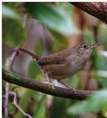
House Wren

House Wrens are prolific, curious, and aggressively territorial during nesting season. HOWR reportedly destroy the eggs of 29 different bird species, and they are hard to deter. Males arrive in early spring (late April in the South and early May in the North) and start making "dummy" nests out of loose sticks. If you find a "dummy nest," you can remove it to deter HOWR nesting. Once the female picks her nest, she completes it with spider webs, feathers, hair, inner bark, or grass and converts it to a deep, conical-