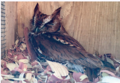
Eastern Screech Owl in nest box at Cubihatcha Outdoor Center.

Atlanta Audubon is pleased to partner with the Cubihatcha Outdoor Center to offer a unique field trip to tour the beautiful forests, wetlands, and drinking reservoirs of this wetland enhancement and protection corridor. Built in 1999, the center encompasses almost 1,000 contiguous acres designated to protect and improve wildlife habitats, while also providing a space for public education and enjoyment. Participants will be treated to a boat tour of one of the reservoirs, where we will explore a variety of habitats. In addition to many species of songbirds, we may see Mallard and Wood Duck families, as well as nesting herons, cormorants, osprey, and perhaps a Bald Eagle. Swallows and Purple Martins also promise to provide a show. We'll also learn about the Wood Duck conservation efforts being done at the center. Space is limited to 15 participants. This trip is free, but registration is required at https://www.atlantaaudubon.org/upcoming-events . Further details will be emailed to participants the week prior to the event.