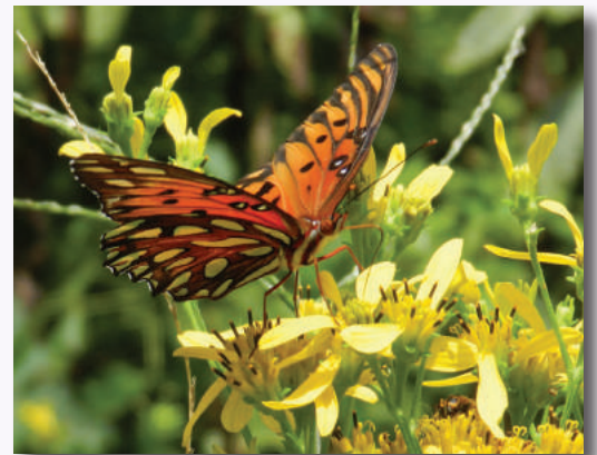
Save the date for the September 16 Wildlife Sanctuary tour.

Each property on the 2017 tour has been certified by Atlanta Audubon Society as a wildlife sanctuary because it provides five essential criteria for attracting wildlife and birds: food sources, nesting sites, bird feeders, shelter, and water sources. Visitors will see a wide variety of native plants and