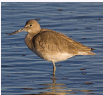
Western Willet, by Dan Vickers

View the current AOS proposals at http://checklist.aou.org/nacc/proposals/current_proposals.html