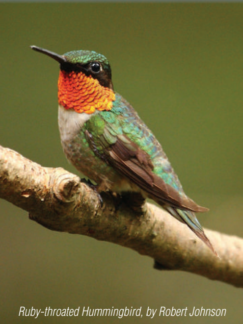
Ruby-throated Hummingbird

Mark your calendar for Saturday, September 16, and make plans to attend the 2017 Wildlife Sanctuary Tour . This year's tour will feature Atlanta Audubon-certified properties in North Atlanta. For 2017, Atlanta Audubon is excited to partner with the Atlanta History Center to feature the beautiful, certified Goizueta Gardens and Living Collection at Atlanta History Center as one of the tour stops.