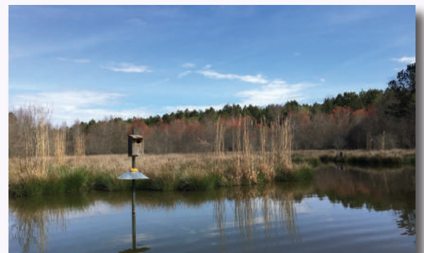
Cubihatcha Outdoor Center