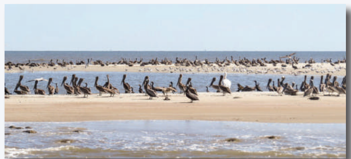
Pelicans and other shorebirds nest on the beach at Gould's Inlet, St. Simons Island.

Registration Opens on March 1 to members and on March 8 to the public.