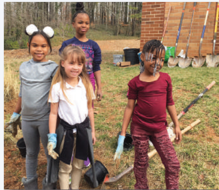
Creating a garden for Birds at Boyd Elementary School.

Students, parents, and teachers at two City of Atlanta elementary schools got their hands in the dirt this winter to plant their very own bird-friendly outdoor classrooms as part of Atlanta Audubon's Connecting Students to STEM through Birds program. In its second year and supported by the Morgens West Foundation and Wells Fargo Foundation, this program works with two schools in underserved communities each year to create outdoor