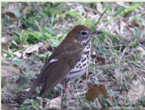
Wood Thrush, by Mary Kimberly

The flute-like call of the Wood Thrush has been disappearing from Georgia's forests over the past several decades because of multiple threats, including building collisions, habitat degradation, and climate change.