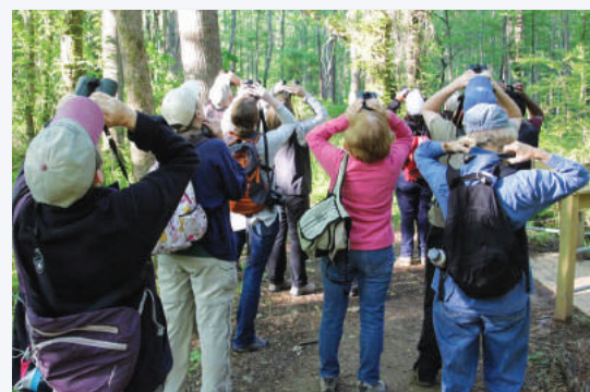
Participants explore the hardwood forests at Serenbe during Atlanta Bird Fest 2016.

Please visit www.atlantaaudubon.org/atlanta-bird-fest for more information and to preview the full schedule of events.