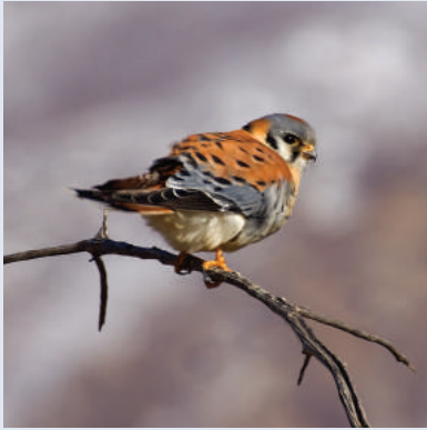
The Migratory Bird Treaty Act protects more than 1,000 species of birds, including American Kestrels.

2018 is officially the Year of the Bird, and Atlanta Audubon is partnering with the National Audubon Society, National Geographic, the Cornell Lab of Ornithology, BirdLife International, and many other organizations to declare 2018 “Year of the Bird.” Through 12 months of storytelling, science, and conservation, we’ll celebrate the wonder of our feathered friends, examine how our changing environment is driving dramatic losses among bird