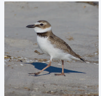
Wilson's Plover