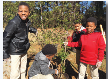
Planting native plants for birds and other wildlife at Boyd Elementary School.