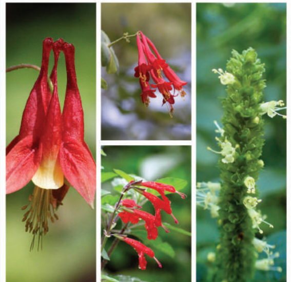
A variety of Plants for Birds will be available for sale at the upcoming Chattahoochee Nature Center plant sale. Pictured here: columbine, coral honeysuckle (top), annual salvia (bottom), and yellow giant hyssop.

Help us make 2018 the Year of the Bird by lending support on these important issues.