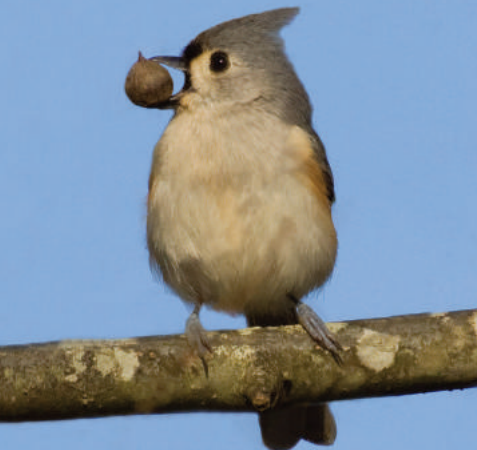
Tufted Titmouse