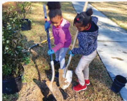
First graders dig into the new garden at Continental Colony Elementary School.

Thanks to the school communities at Boyd and Continental Colony elementary schools for their partnership in this year's project and to Convivial Gardens for leading our student crews.