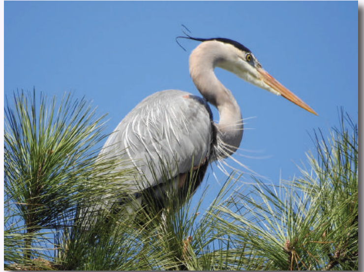
Great Blue Heron at Westminster School.

Many other great birds turn up in the unlikeliest of places around our city. While leading students on birds walks at Westminster School, not far from the bustling heart of Buckhead, students and teachers were amazed by the Great Blue Heron rookery behind the school’s gymnasium. Seeing these large, prehistoric looking birds landing among the tall pine canopy with nesting material in their beaks was a thrill for everyone, including me! After finishing another school program recently, I stopped by the nearby Howell Mill Water Treatment Plant, which is actually an eBird “hotspot.” Right in the middle of the city, I