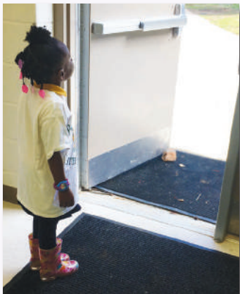
A pre-kindergarten student at Boyd Elementary tries to spot one last bird before returning to class.

Many other great birds turn up in the unlikeliest of places around our city. While leading students on birds walks at Westminster School, not far from the bustling heart of Buckhead, students and teachers were amazed by the Great Blue Heron rookery behind the school’s gymnasium. Seeing these large, prehistoric looking birds landing among the tall pine canopy with nesting material in their beaks was a thrill for everyone, including me! After finishing another school program recently, I stopped by the nearby Howell Mill Water Treatment Plant, which is actually an eBird “hotspot.” Right in the middle of the city, I