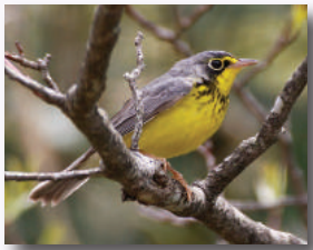
Canada Warbler