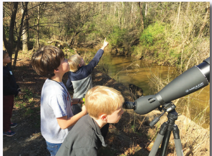
Students at Westminster School enjoyed a close-up look at a Blue Heron Rookery behind their school.

Luckily, in spite of the numerous ways humans make the landscape less inviting for birds, they have continued to adapt and survive for nearly 170 million years, carving out their niches in every imaginable habitat, including our concrete jungles. We as individuals can take meaningful steps to ensure they continue to grace us with their presence. Simple actions like turning off our lights at night to reduce light pollution, maintaining a feeder or bird bath, and planting bird-friendly native plants in our gardens and community spaces can provide important, life-saving benefits for birds trying to make a home or navigate their way through our urban landscapes. So put out the welcome mat, and keep your binoculars handy. You never know who might show up at your doorstep.