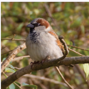
House Sparrows are not native to the U.S.

Here are some other things that you can try to prevent the House Sparrows from nesting on top of your porch light that will not harm the birds: They are attracted to this site not only because it is protected (and probably warm) but also because it is level. If you can add a block, board or other material to create a slope of more than 45 degrees, the birds will not be able to nest. Another suggestion is to fasten a loose spring with at least an inch between each coil to the area, which would make the area unsuitable for nesting. You may also try to attaching Mylar strips or pieces of aluminum foil to the area to discourage the birds.