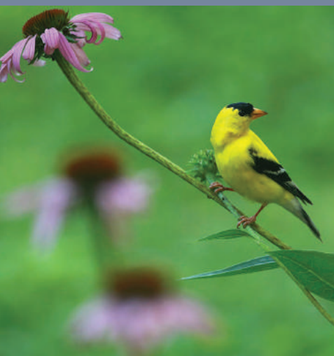
American Goldfinch on coneflower