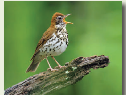
Sign up for Wood Thrush Watch for 2018.

Help us learn more about the Wood Thrush by participating in Wood Thrush Watch. Your participation will help Atlanta Audubon gain a better understanding of Wood Thrush distribution and breeding success in our region. We are encouraging people to go birding during Wood Thrush migration and breeding season, from April to October. Your birding efforts should target under-birded Wood Thrush habitat in addition to well-known hotspots. Our goal is to see 100 checklists submitted during Wood Thrush Watch 2018. We hope to use these findings to help guide future habitat restoration projects and shape our conservation programs going forward. To learn more, submit a checklist, or to take our fun Wood Thrush ID quiz, visit www.atlantaaudubon.org/wood-thrush-watch .