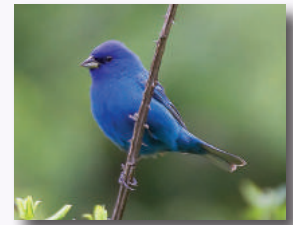
Indigo Bunting

Cost: $30. For more information or to register, go to www.atlantaaudubon.org/abf-events .