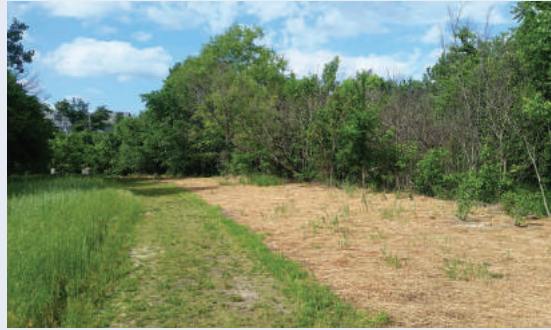
The Georgia Outdoor Stewardship Act would help Georgia acquire and maintain additional lands for birding and wildlife recreation without increasing taxes.

Atlanta Audubon urges a “yes” vote for birds on Nov. 6.