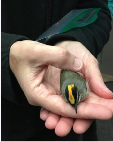
This Golden-crowned Kinglet was found by one of our Project Safe Flight volunteers one morning this spring.

Atlanta Audubon is always in need of Project Safe Flight Atlanta volunteers. The more volunteers, the more information we can collect on which bird species are colliding with buildings. Since the program began in fall 2015, more than 900 birds, representing 90 different species, have been collected.