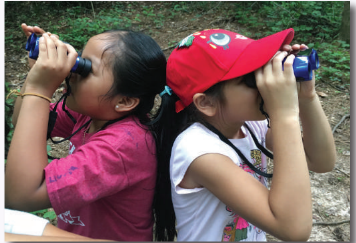
The grant will allow Atlanta Audubon to welcome a new partner school to our Connecting Students with STEM through Birds program.