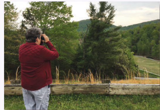
The Georgia Outdoor Stewardship Amendment would create a dedicated stream of conservation funding for acquisition and management of lands for birders and other outdoor enthusiasts.

Funds would also be made available as grants to cities, counties, or nongovernmental organizations, to help secure and expand access to properties, both rural and urban, that are critical to Georgia's wildlife