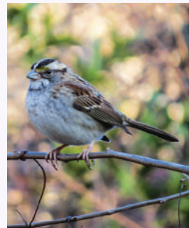
White-crowned Sparrow

Master Birder in Good Volunteer Standing: $45