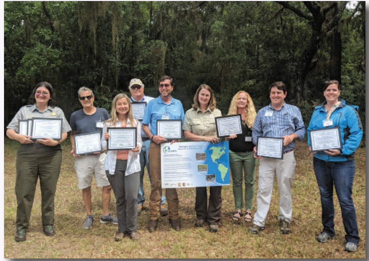
Site partners celebrate the Georgia Barrier Island WHSRN site designation at Harris Neck NWR.