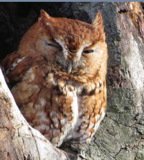
Eastern Screech Owl