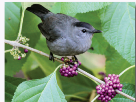
Native plants and birds go hand in hand. This Gray Catbird is feasting on American beautyberry plant, which is one of the species that will be offered at the fall plant sale.

Atlanta Audubon will once again partner with Beech Hollow Farms for our fall Open House sale at the Blue Heron Nature Preserve. Beech Hollow specializes in saving and propagating native plants from the metro Atlanta area that are threatened by development and invasive species. This fall's sale will focus on berry producing shrubs and small trees that provide crucial energy resources to birds like the Wood Thrush to prepare for fall migration. Many of these migrants will cross the Gulf of Mexico, so packing on the weight in advance of their amazing journey is critical. The plant sale will feature serviceberry, spicebush, hearts-a-burstin', chokeberry, sweetspire, and beautyberry. Plants will be available for presale on the Atlanta Audubon website beginning September 17 at www.atlantaaudubon.org/plant-sales .