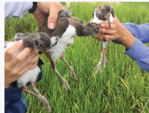
A group of nearly fledged American Oystercatcher chicks with new leg bands.