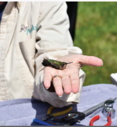
Hummingbird banding demonstration.

Our first birding outing was a boat ride around Hog Island in the Muscongus Bay, where we spotted Common Eiders, Surf Scoters, Black Scoters, and the first of many Black Guillemots and Double-crested Cormorants. The highlight of the trip was seeing three Long-tailed Ducks—a male and two females—gracefully gliding through the water as everyone scrambled to one side of the boat to get a good look at them. Later, we watched a banding demonstration and learned the hows and whys of bird banding as well as what equipment is needed. A Ruby-throated Hummingbird was caught right before our eyes. We watched, fascinated, as Sandy Lockerman, a master hummingbird bander, carefully banded the hummingbird and explained modifications to the banding process for hummingbirds, such as using much smaller than normal bands. After the banding demonstration, we returned to the mainland for a short visit to Mad