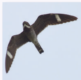
Common Nighthawk, by Dan Vickers.

A: Thanks for contacting Atlanta Audubon Society. I can't be certain by your description, but my guess is that the birds you are seeing are likely Common Nighthawks. These birds are often seen at dawn and dusk as they feed on the wing, snatching insects out of the air in their beaks. They may be attracted to clouds of insects that swarm around bright lights at night, such as buildings, billboards, and even the Braves Stadium. As they prepare for migration to South America in the fall, they may form large flocks as they feed.