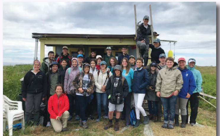
Group photo of camp participants, by Selu Adams.