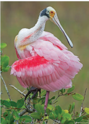
Roseate Spoonbill

A course fee of $425 includes classes and guided walks, course materials, and the graduation luncheon. Registration is now open at www.atlantaaudubon.org/master-birder-program .