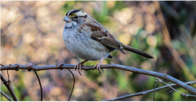
White-throated Sparrow