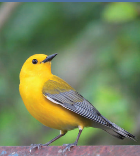
Prothonotary Warbler