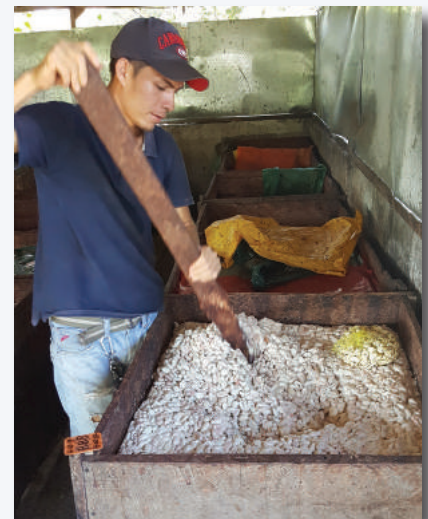
Turning cocoa beans at chocolate farm in Costa Rica.

In 2018, Xocolatl Small Batch Chocolates and Atlanta Audubon crossed paths thanks to Joy Carter, a long-time member and former board member, and entered into a cooperative agreement to produce a collaboration chocolate bar that's good for people and birds. Come hear about the chocolate production process and learn how the chocolate you choose to eat can help slow deforestation, help birds, and bring better wages to cacao farmers worldwide. You might also get to sample some of the delicious offerings from this unique chocolate factory with a storefront in Krogg Street Market.