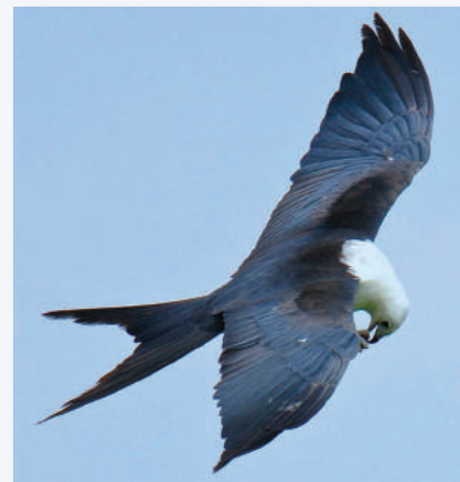
Swallow-tailed Kite in flight