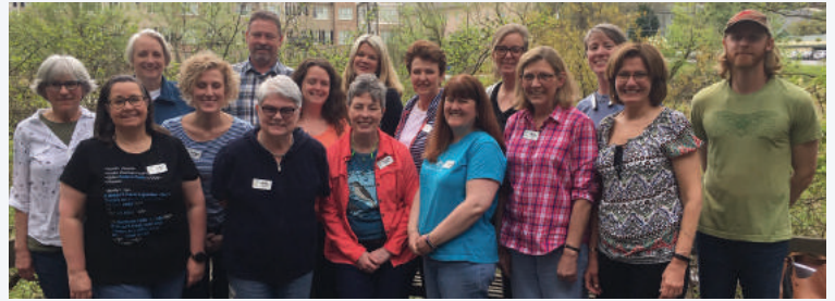
The Winter 2019 Master Birder class following the final exam and luncheon.