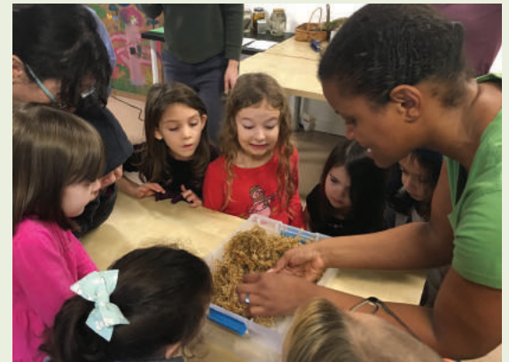
Eco-Adventures for Homeschoolers meets on the second Friday of each month.

Open to children ages 5 to 12. This is a drop-off program, but parents may stay if they wish. For information on 2019 programs or to register, visit https://bhnp.org/homeschool/#at-home-outdoors