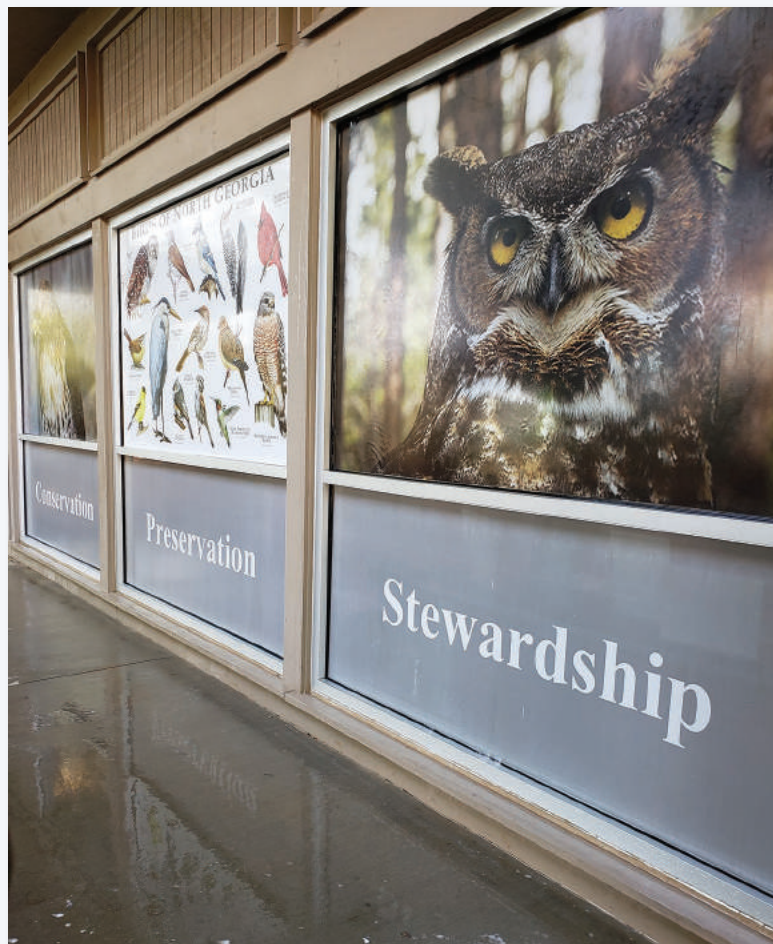
CollidEscape Window Treatment at Sawnee Mountain Preserve.

For more information on the Project Safe Flight Atlanta or Lights Out Atlanta programs, please visit www.atlantaaudubon.org/project-safe-flight-atlanta .