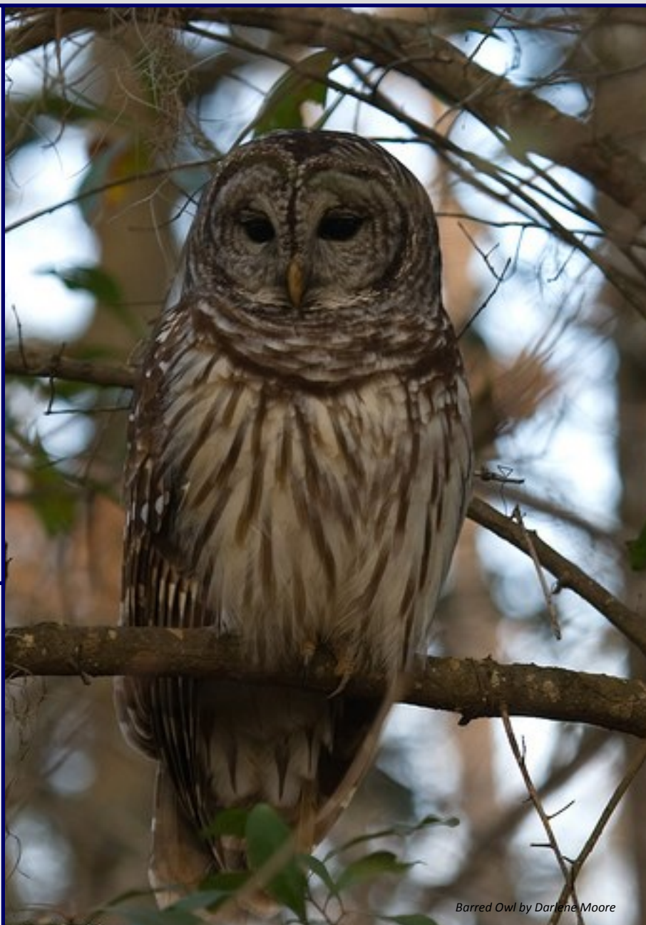
Barred Owl by Darlene Moore

Owl feathers are soft and fluffy on top and have tiny bristles along the edges. This muffles the sound created by a flapping wing and allows owls to better take their prey by surprise. Most owl plumages , or feather patterns, are dull, earthy colors that provide excellent camouflage , or the ability to blend in