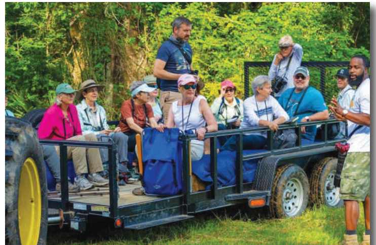
Birding at Alabama's Black Belt.