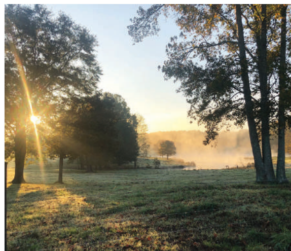
Longview Cattle Farm.