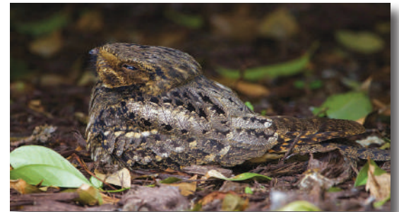
The Chuck-will's-widow is Georgia Audubon's 2022 to 2205 species of concern.

Georgia's birds face a number of challenges, ranging from habitat loss and degradation, collisions with structures, pesticide use, climate change, and more. Some of the most unique, secretive, and compelling of Georgia's birds facing these threats are the nightjars. There are three species of nightjars in Georgia: The Chuck-will's-widow, or "Chucks," Eastern Whip-poor-will, and the Common Nighthawk. While all three of these