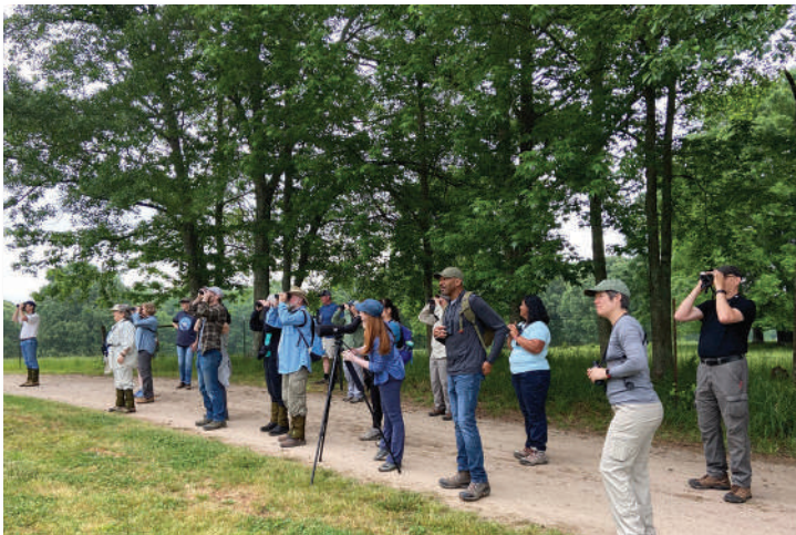
Birding at Longview Cattle Farm.

To learn more or sign up, visit www.georgiaaudubon.org/field-trips .