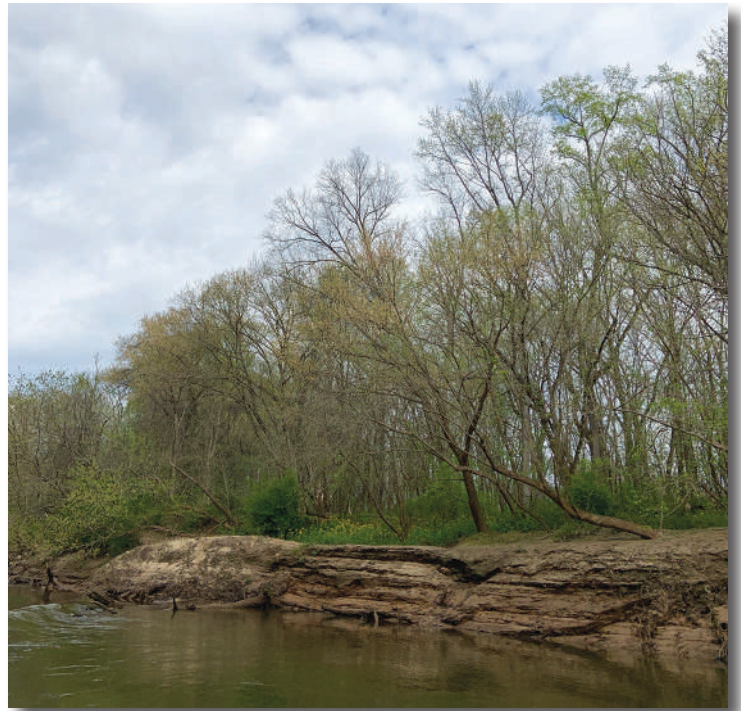
View of Buzzard Roost from the Chattahoochee River.

That workday was at the Island Ford Unit of CRNRA, where the team is looking forward to seeing some of the more than 500 installed native plants come to life over the coming weeks. The team will be transitioning from planting into management of the space with the help of many volunteers over the coming months. (Come join