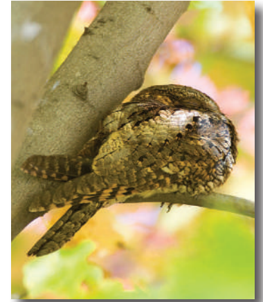
Eastern Whip-poor-will.